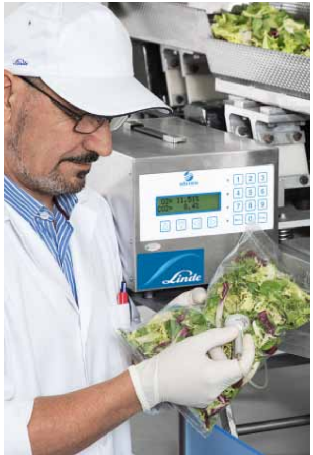
Packaging of salad with flow-pack machine