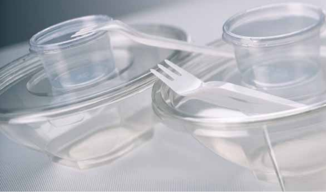
Various packaging materials