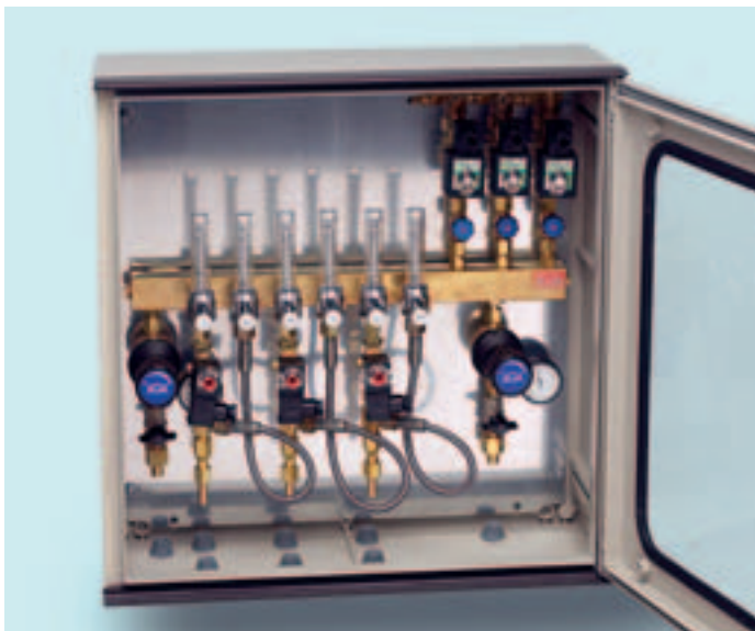
The photo above shows a cabinet for three tanks with operating oxygen and emergency oxygen. This cabinet is shown with a separate pressure regulator for emergency oxygenation.