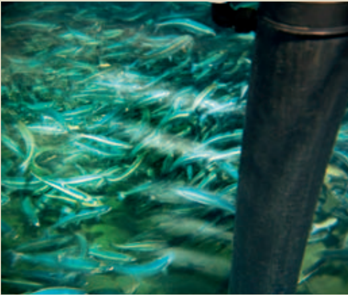
SOLVOX®Stream application in a fish tank