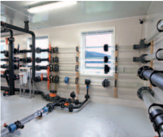
Transparent pipework to visualise optimum gas dissolution

equipment to perform environmental analyses as well as field measurements. We are therefore well equipped to work with aquaculture customers and are conducting experiments in order to optimise solutions by replicating typical conditions existing on a fish farm.