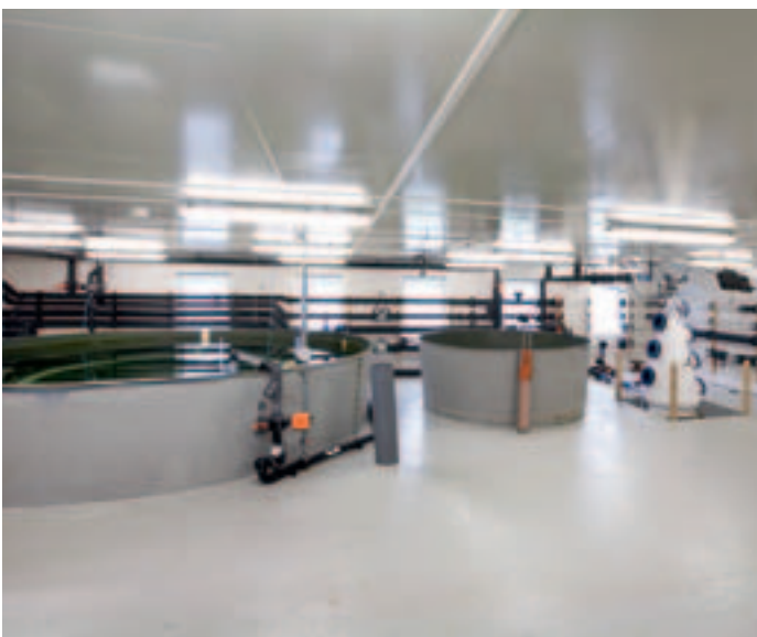
Technical hall with fish tanks and gas-dissolving equipment