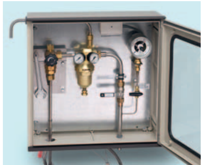
Back-up cabinet: this dosing cabinet ensures that oxygen is supplied from cylinders or cylinder bundles in case of interruption of liquid oxygen supply.