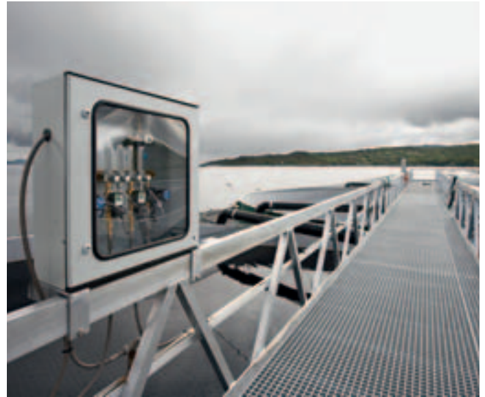
Control cabinet installation on a fish farm site.